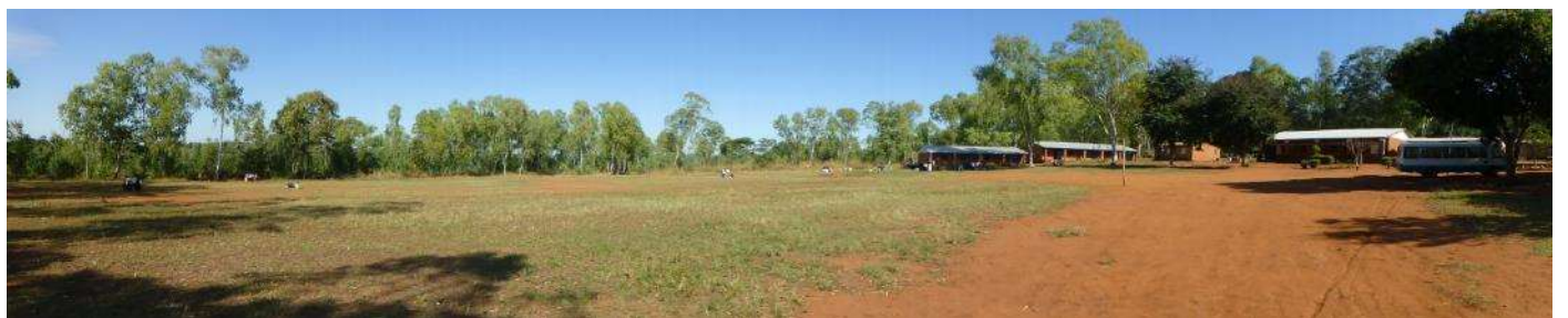
Mulanje Mission Community Day Secondary School