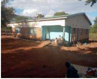
Completed Teachers houses