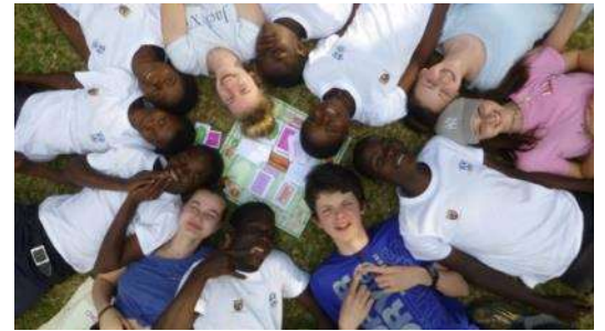
Fortrose and Mulanje students in Mulanje in 2018